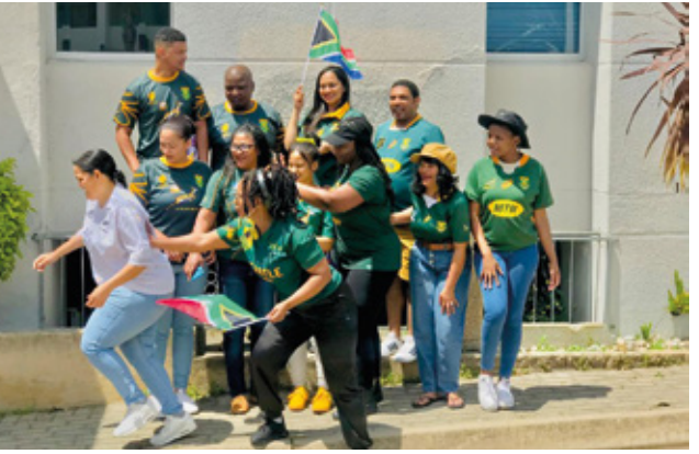
Bitou Human Resources department backing the Bokke.